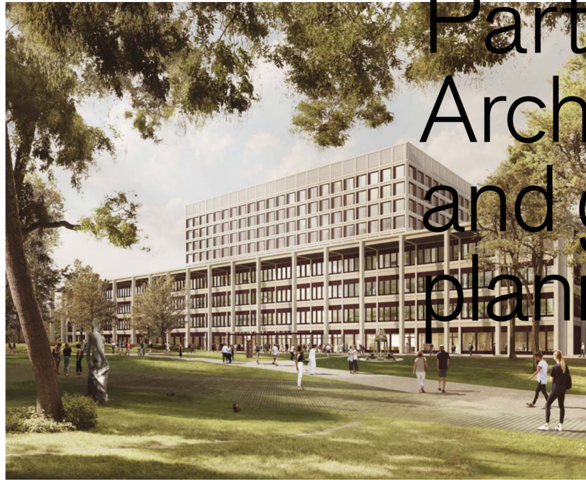
Visualization: Ponne Images

At the start of 2019, our teaching and learning center for the RheinMain University of Applied Sciences in Wiesbaden emerged from a competition as the winning project. This new building has a workshop-like nature and invites students to communicate. The inner structure and division of space in the compact new four-story building with 4,000 m 2 of utilizable area offer very high flexibility. Here, from the start of 2023 onward, students of various disciplines will find excellent conditions for learning.