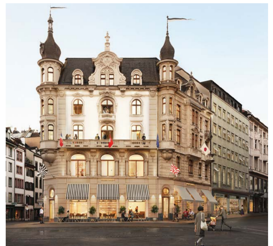
Visualization: Nighnurse Images

Crèche de Collonges on Avenue de France in Lausanne is characterized by our stylish interior design. The crèche has been in use since summer 2019 and accommodates 56 children in a building from the 1930s. This project was part of a larger building renovation, encompassing 125 apartments and 15 stores, which we carried out for Helvetia Assurances with utmost care, preserving the historical building fabric.